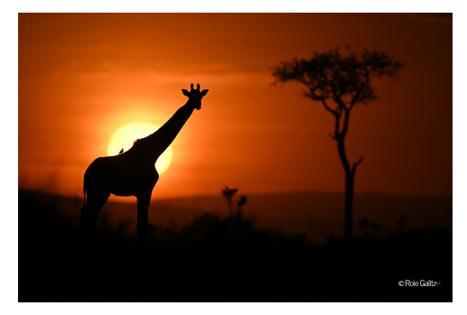
Fig. 7 Example of photograph with strong light source on screen

ducted ray tracing simulations at the design stage and optimized the shape and placement of the mechanical parts to prevent ghosts and flare from those parts.