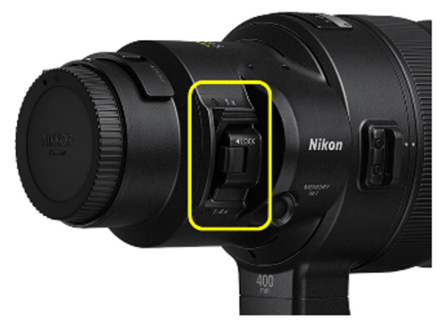
Fig. 2 Built-in teleconverter switch

In addition to ease of handling, the built-in teleconverter has a distinct advantage over general-purpose teleconverters in terms of performance. Most often, external teleconverters are designed to maintain the same performance as that of the lens to which they can be attached, whereas built-in teleconverters are designed specifically to match the performance of the specific model of the lens, thereby ensuring improved design performance. Moreover, various adjustments, such as the focus adjustment and the resolution performance inspections, are conducted during the production process for both scenarios, i.e., when the built-in teleconverter is in use and when not in use, to ensure high-quality photographs can be captured regardless of whether the built-in teleconverter is used or not.