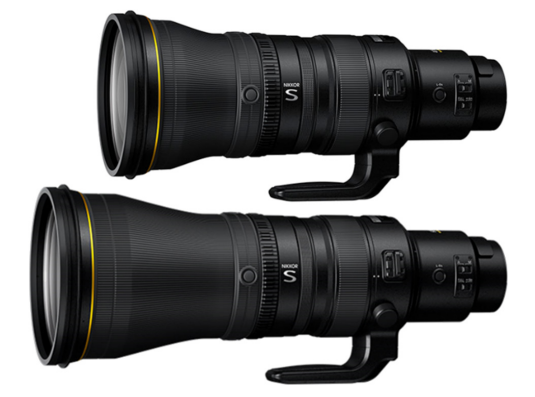
Fig. 1 Top: NIKKOR Z 400mm f/2.8 TC VR S Bottom: NIKKOR Z 600mm f/4 TC VR S

In 2022, Nikon released two Z-mount super-telephoto prime lenses designated as "NIKKOR Z 400mm f/2.8 TC VR S" (hereinafter, "Z400/2.8") and "NIKKOR Z 600mm f/4 TC VR S" (hereinafter, Z600/4) (Fig. 1). Both these lenses, i.e., the Z400/2.8 and Z600/4, are equipped with a built-in 1.4x teleconverter, whereby the Z400/2.8 is able to switch between focal lengths 400 and 560mm, and the Z600/4 is able to switch between focal lengths 600 and 840mm.