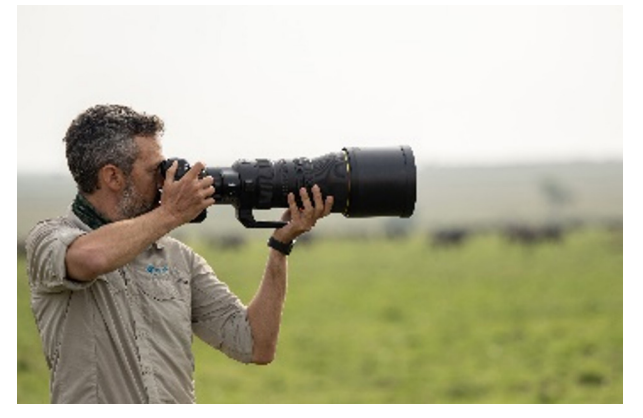
Fig. 3 Handheld shooting using Z400/2.8 and Z9