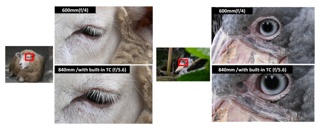
Fig. 5 Image quality when using built-in teleconverter

The photograph (Fig. 5) shows the same subject taken at 600 and 840mm using the built-in teleconverter. Even subjects with fine lines, such as animal hair, are depicted in detail at the maximum aperture, with each line individually depicted, and the high resolution that was achieved can be observed regardless of the built-in teleconverter use. There is the illusion of the sheep and shoebill being right in front of the viewer. This expressive power is the appeal of the super-telephoto prime lenses to photographers, who will not be able to resist the temptation to take them out for shooting.