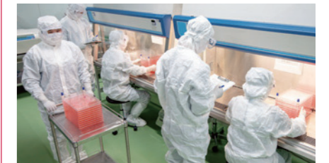
Cell & Gene Therapy Contract Development and Manufacturing

Capable of capturing an ultra-wide-field retinal image covering approximately 80% of the retina and a cross-sectional retinal image at any position in the ultra-wide-field image in one device.