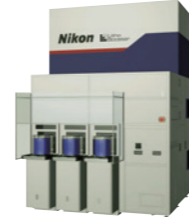
Alignment Station "Litho Booster"

Developed for high-volume advanced node-application manufacturing. Equipped with the high-performance "inline Alignment Station (IAS)." Enabling superior overlay accuracy and remarkable throughput.