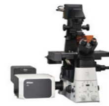
Confocal based Super-Resolution Microscope "AX with NSPARC"

The Healthcare Business comprises three solutions based on Nikon's core technologies in advanced optics and image processing and analysis. "Life Science Solutions" contribute to progress in the fields of bioscience research and drug discovery by making it possible to visualize and analyze various biological events using our microscope technology, which has about 100 years of history. "Eye Care Solutions" provide ophthalmology instruments and systems based on proprietary technology that contribute to early detection of eye diseases and improvement of quality of life. "Contract Cell Development and Manufacturing" provides a broad range of contract development and manufacturing services for cell and gene therapy in Japan. In an era of increasing human longevity, Nikon aims to support the health and well-being of as many people as possible in a society where people lead longer, healthier lives.