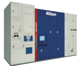
Semiconductor Lithography System "NSR-5635E"

Gen 8 Plate FPD Lithography System. Supporting panels for high-value-added premium displays, such as smart devices, high-end monitors, and large-screen TVs.